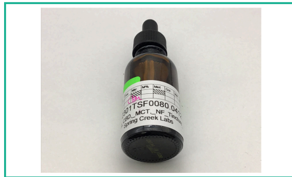
The photo on this report is of a sample collected by the lab and may vary from the final packaging

Test performed via Hardy chromogenic dry and agar plates. ND = Non Detect; LOQ = Limit of Quantitation; Tested Microbial Endpoints: Total Viable Aerobic Bacteria, Total Yeast and Mold, Total Coliforms, Enterobacteriaceae, Aspergillus (flavus, fumigatus, niger and terreus), E.coli pathogenic strains, and Salmonella spp. Microbial testing performed per SOP-000004 Method. LOQ has been set to the Limit of Detection (LOD) / Method Detection Limit (MDL) for all endpoints.